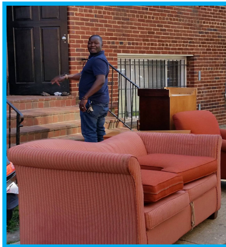
We love our partners KEYS for the Homeless who helped furnish an apartment for a recent move in!