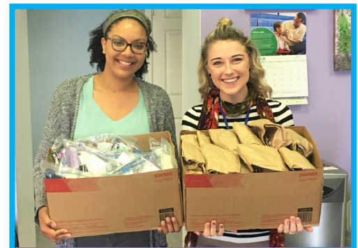
Georgetown Day students made toiletry and trail mix bags for our Outreach teams to use as engagement tools.